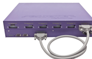
EPS-C2 Connected to a Summit X440